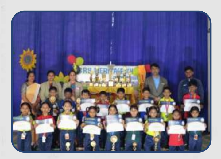
AWARDS' DAY CELEBRATION