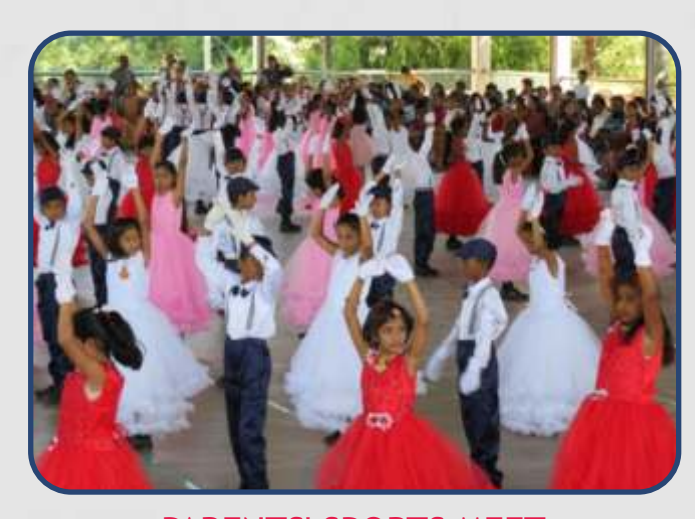
PARENTS' SPORTS MEET