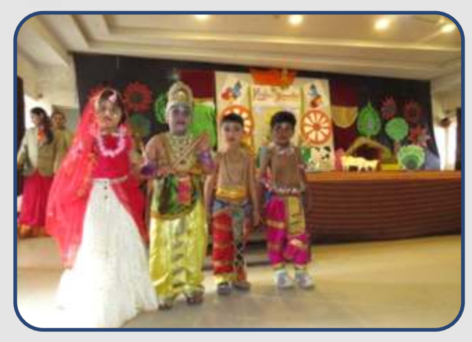
KRISHNA JANMASTAMI CELEBRATION