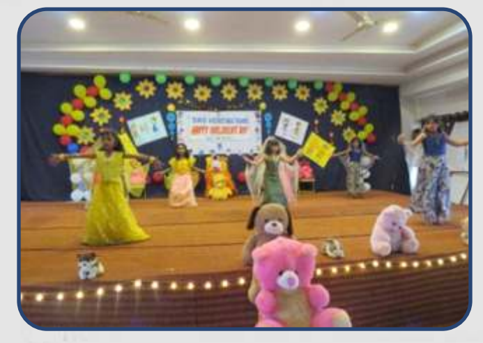
CHILDREN'S DAY CELEBRATION