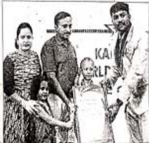
ಚಿತ್ರದರ್ಚಿದ ಎಸ್.ಆರ್.ಎಸ್. ಪರಿಟೀಚ್ ಕಾಲೆಯ ಒಂದರೇ ಕರಣಿಯ ವಿದ್ಯೆಕ್ ಅರುದ್ದ ರೂಚಿಗೆ ಚಿನ್ನೆ ಸಲ್ಲಿ ನಡೆದ ಕರಾಮ್ ಪರ್ಲ್ಡ್ ರೇಂಡ್ ೯ secting code Extraordinary Grasping Power genius hid gray aground go.

giginal enthunito, asias begantif ಪರಭಗಳರು ಹೇಳುವುದು, 195 ದೇಶಗಳ ಹರದುಗಳು, 1 ರಿಂದ 10 sidne romand streets. ವಿರಾಧಿಗಳು ಮತ್ತು ಅವರ Accomplished, undered methy state, emerged ವೇಳುವನ್ನು ರಾಮಾಯಣ ಮತ್ತು ಪಲ್ಲೆಗಳನ್ನು ಹೇಳುವ ಮೂಲಕ ಈ